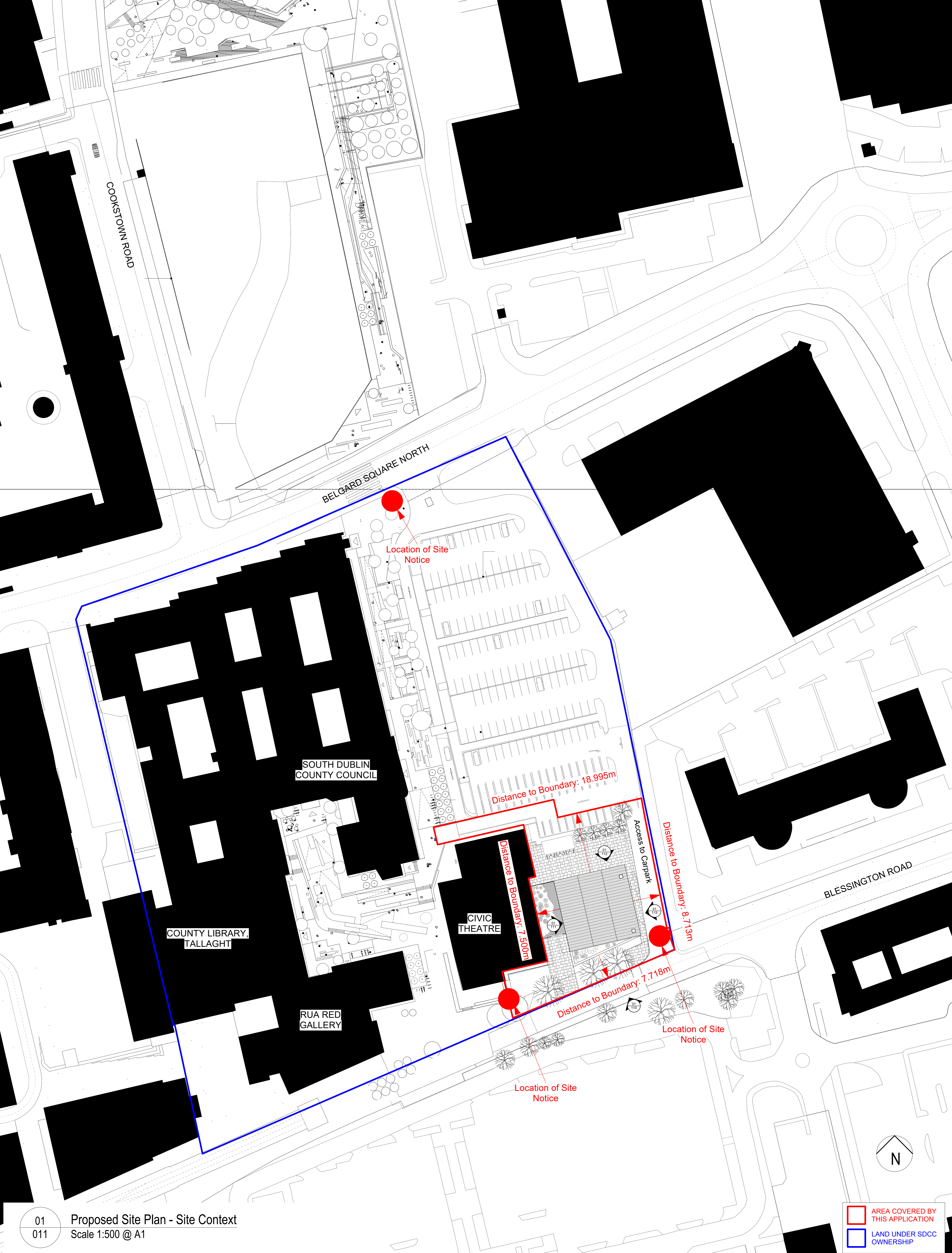
01 Proposed Site Plan - Site Context 011 Scale 1:500 @ A1